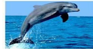
NATIONAL AQUATIC ANIMAL