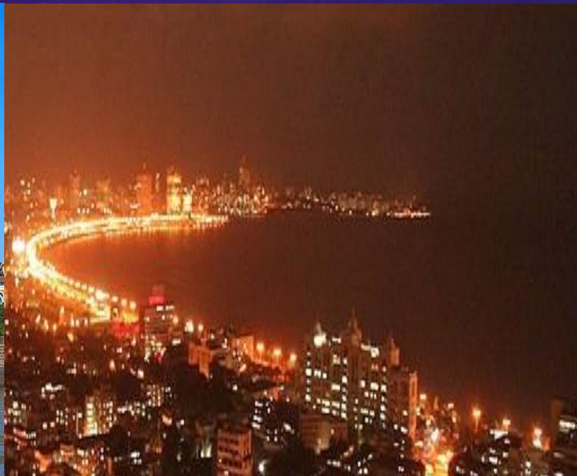
Marine Drive(Queen's Necklace)