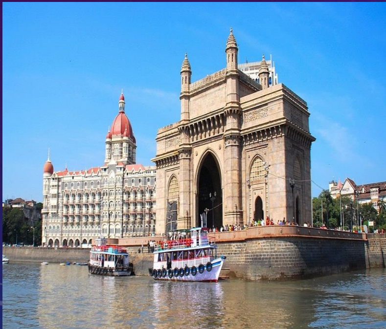
Gateway of India and Taj hotel